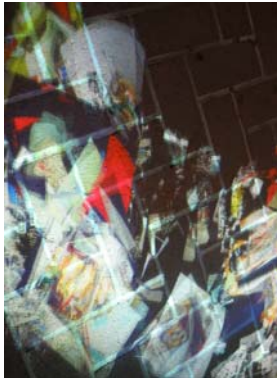
Figure 2: Completed and deployed Jetsam Trashcan